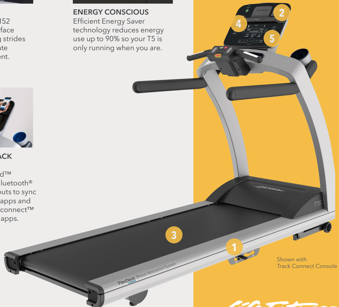
Shown with Track Connect Console

Choose between the engaging and interactive Track Connect console and the intuitive Go Console.